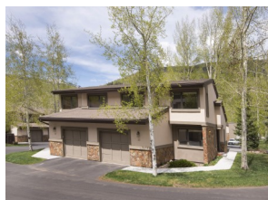
Listed by East Vail Team 23 Mountain Meadow $910,000 - asking price 3 bedrooms & attached garage