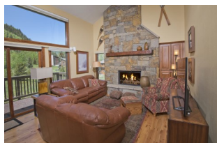
Listed by East Vail Team 910 Timber Falls $885,000 - asking price 3 bedrooms & gorgeous views