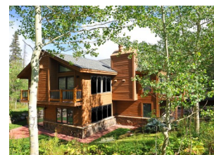
Under Contract by East Vail Team 5027 Ute Lane #B $1,454,000 - asking price 3 bedrooms & private location