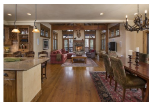
Under Contract by East Vail Team 4346 Spruce Way $2,275,000 - asking price 4 bedrooms & creek location