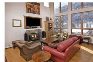
Under Contract by East Vail Team 4145 Spruce Way #B $1,199,000 - asking price 3 bedrooms & panoramic views