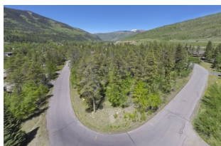
Listed by East Vail Team 5169 Gore Circle $1,350,000 - asking price Vacant lot with big views