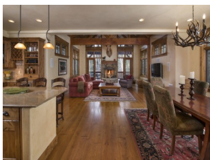
Under Contract by East Vail Team 4346 Spruce Way $2,275,000 - asking price 4 bedrooms & creek location