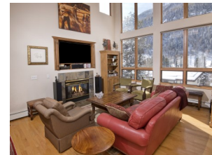
Under Contract by East Vail Team 4145 Spruce Way #B $1,199,000 - asking price 3 bedrooms & panoramic views