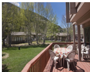
Listed by East Vail Team A-4 Bighorn Townhome $855,000 - asking price 3 bedrooms & mountain views