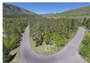
Listed by East Vail Team 5169 Gore Circle $1,350,000 - asking price Vacant lot with big views