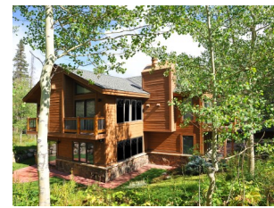
Under Contract by East Vail Team 5027 Ute Lane #B $1,454,000 - asking price 3 bedrooms & private location