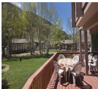
Listed by East Vail Team A-4 Bighorn Townhome 3 bedrooms & mountain views $855,000 - asking price