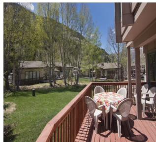
Listed by East Vail Team A-4 Bighorn Townhome 3 bedrooms & mountain views $855,000 - asking price