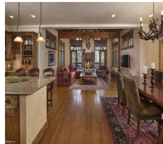
Under Contract by East Vail Team 4346 Spruce Way 4 bedrooms & creek location $2,275,000 - asking price