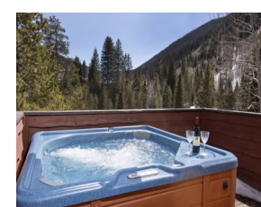
Sold by East Vail Team 4277 Columbine Drive $675,000 - sold price 2 bedrooms & mountain views