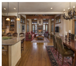
Under Contract by East Vail Team 4346 Spruce Way $2,275,000 - asking price 4 bedrooms & creek location