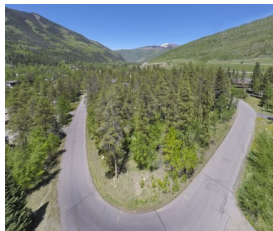
Listed by East Vail Team 5169 Gore Circle $1,350,000 - asking price Vacant lot with big views