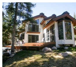
Under Contract by East Vail Team 4266 Columbine Drive $2,385,000 - asking price 4 bedrooms on Gore Creek