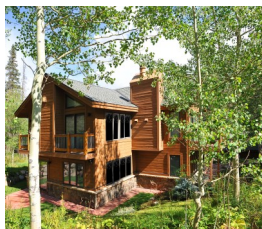
Under Contract by East Vail Team 5027 Ute Lane #B $1,454,000 - asking price 3 bedrooms & private location