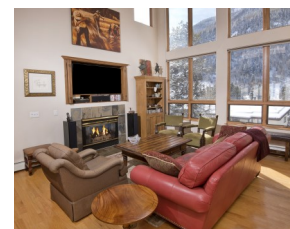
Under Contract by East Vail Team 4145 Spruce Way #B $1,199,000 - asking price 3 bedrooms & panoramic views