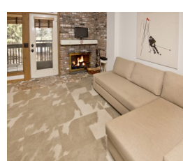
Under Contract by East Vail Team Vail Racquet Club Bldg. 2 Unit 3 $389,900 - asking price 1 bedroom on Gore Creek