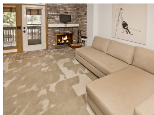
Under Contract by East Vail Team Vail Racquet Club Bldg. 2 Unit 3 $389,900 - asking price 1 bedroom on Gore Creek