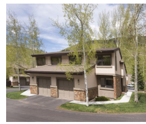
Listed by East Vail Team 23 Mountain Meadow $910,000 - asking price 3 bedrooms & attached garage