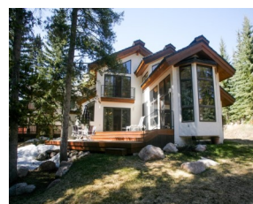
Under Contract by East Vail Team 4266 Columbine Drive $2,385,000 - asking price 4 bedrooms on Gore Creek