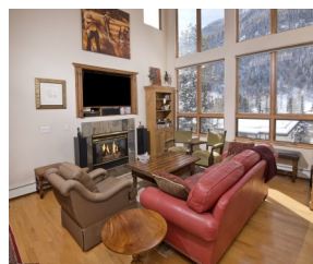
Under Contract by East Vail Team 4145 Spruce Way #B $1,199,000 - asking price 3 bedrooms & panoramic views