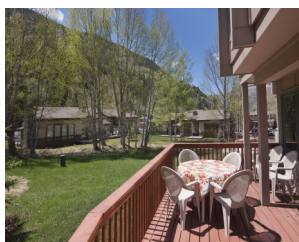
Listed by East Vail Team A-4 Bighorn Townhome $855,000 - asking price 3 bedrooms & mountain views