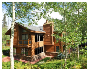
Under Contract by East Vail Team 5027 Ute Lane #B $1,454,000 - asking price 3 bedrooms & private location