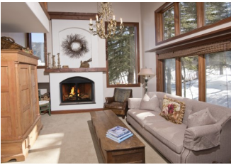
Sold by East Vail Team 18 Riverbend $1,100,000 - sold price 3 bedrooms & next to Bighorn Park