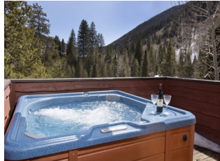
Under Contract by East Vail Team 4277 Columbine Drive $695,000 - asking price 2 bedroom & mountain views