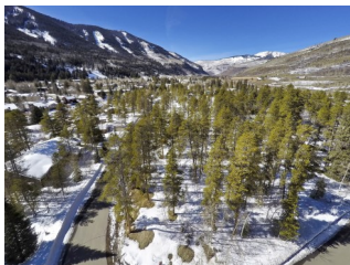
Listed East Vail Team 5169 Gore Circle $1,445,000 - asking price vacant lot with big views