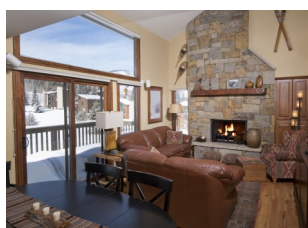
Listed by East Vail Team 910 Timber Falls $885,000 - asking price 3 bedrooms & gorgeous views