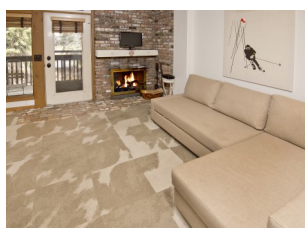
Listed by East Vail Team Vail Racquet Club Bldg. 2 Unit 3 $389,000 - asking price 1 bedroom on Gore Creek