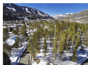
Listed by East Vail Team 5169 Gore Circle $1,445,000 - asking price Vacant lot with big views