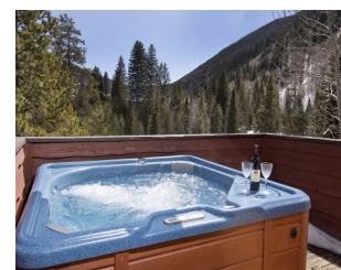
Under Contract East Vail Team 4277 Columbine Drive $695,000 - asking price 2 bedrooms & mountain views