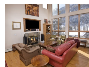
Listed by East Vail Team 4145 Spruce Way #B $1,199,000 - asking price 3 bedrooms & panoramic views