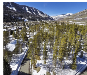
Listed by East Vail Team 5169 Gore Circle $1,445,000 - asking price Vacant lot with big views