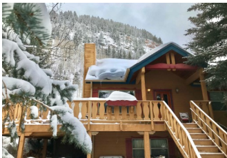
Just Sold by East Vail Team 3796 Lupine Drive $1,450,000 - sold price 4 bedroom & zoned duplex