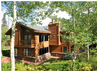
Listed by Jane 5027 Ute Lane #B $1,454,000 - asking price 3 bedrooms & private location