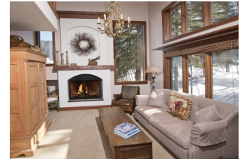
Under Contract by East Vail Team 18 Riverbend $1,199,000 - asking price 3 bedrooms & next to Bighorn