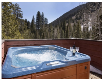
Under Contract by East Vail Team 4277 Columbine Drive $695,000 - asking price 2 bedroom & mountain views