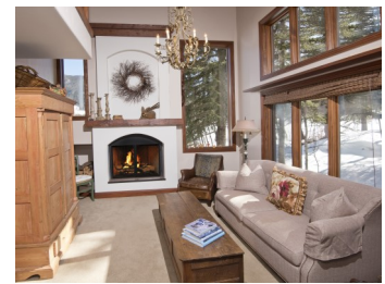
Under Contract by East Vail Team 18 Riverbend $1,199,000 - asking price 3 bedrooms & next to Bighorn Park