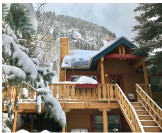
Just Sold by East Vail Team 3796 Lupine Drive $1,450,000 - sold price 4 bedroom & zoned duplex