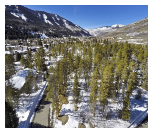
Listed by East Vail Team 5169 Gore Circle $1,445,000 - asking price Vacant lot with big views