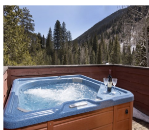
Under Contract by East Vail Team 4277 Columbine Drive $695,000 - asking price 2 bedrooms & mountain views