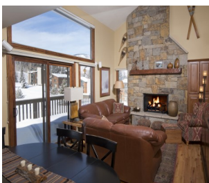
Listed by East Vail Team 910 Timber Falls $885,000 - asking price 3 bedrooms & gorgeous views