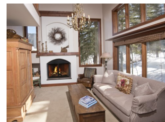
Under Contract by East Vail Team 18 Riverbend $1,199,000 - asking price 3 bedrooms & next to Bighorn Park