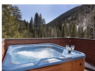
Under Contract East Vail Team 4277 Columbine Drive $695,000 - asking price 2 bedrooms & mountain views