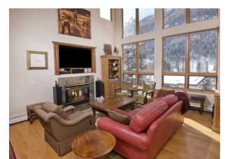
Listed by East Vail Team 4145 Spruce Way #B $1,199,000 - asking price 3 bedrooms & panoramic views