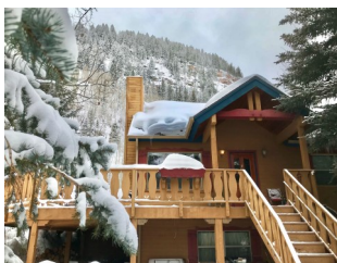
Just Sold by East Vail Team 3796 Lupine Drive $1,450,000 - sold price 4 bedroom & zoned duplex