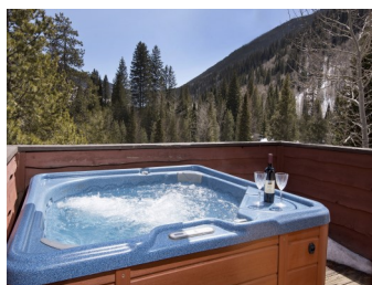
Under Contract by East Vail Team 4277 Columbine Drive $695,000 - asking price 2 bedrooms & mountain views