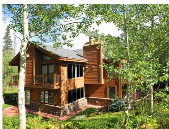
Listed by Jane 5027 Ute Lane #B $1,454,000 - asking price 3 bedrooms & private location