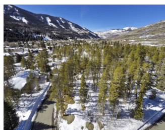
Listed by East Vail Team 5169 Gore Circle $1,445,000 - asking price Vacant lot with big views