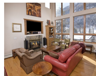
Listed by East Vail Team 4145 Spruce Way #B $1,199,000 - asking price 3 bedrooms & panoramic views