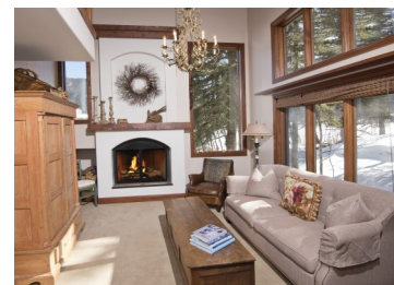
Under Contract by East Vail Team 18 Riverbend $1,199,000 - asking price 3 bedrooms & next to Bighorn Park