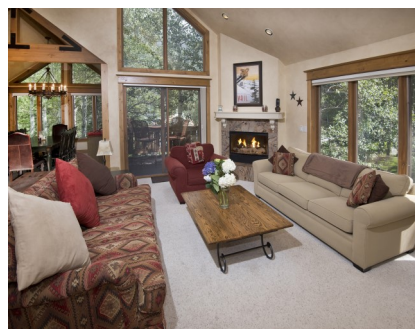
5027 Ute Lane #A - Listed and Sold $1,550,000 - Sold Price 5 bedrooms & 3.5 baths - private location