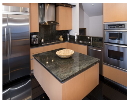
5027 Ute Lane # B - Listed and Under Contract $1,454,000 - Asking Price 3 bedrooms & 3.5 baths - very private location