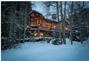
Listed by East Vail Team 4440 Glen Falls Lane $2,730,000 - asking price 4 bedrooms & private location