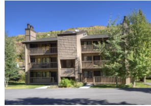
Sold by East Vail Team #10 Vail East Townhouse Condos $593,000 - sold price 3 bedrooms & mountain views