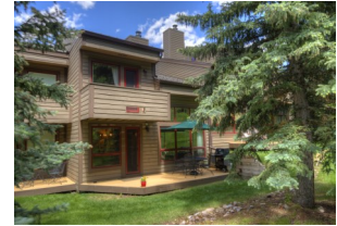
Sold by East Vail Team 38 Courtside $1,100,000 - sold price 3 bedrooms & private setting