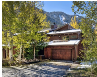
Listed by East Vail Team 4999 Main Gore Drive #A $1,385,000 - asking price 4 bedrooms & private location