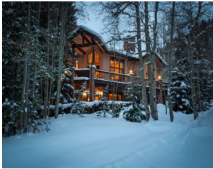
Listed by East Vail Team 4440 Glen Falls Lane $2,730,000 - asking price 4 bedrooms & sunny location