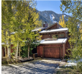
Listed by East Vail Team 4999 Main Gore Drive #A $1,385,000 - asking price 4 bedrooms & 2 car garage