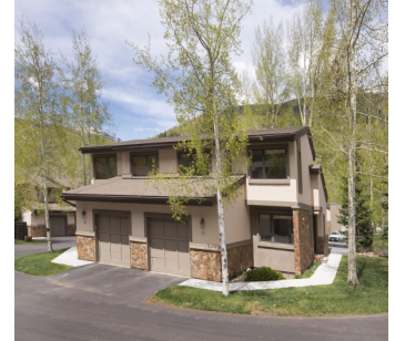
Sold by East Vail Team 23 Mountain Meadow $850,000 - sold price 3 bedrooms & attached garage