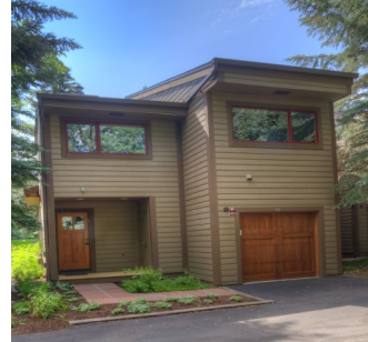
Sold by East Vail Team 44 Courtside $959,000 - sold price 3 bedrooms & attached garage