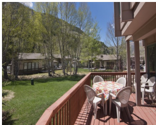
Under Contract by East Vail Team A-4 Bighorn Townhome $779,000 - asking price 3 bedrooms & mountain views