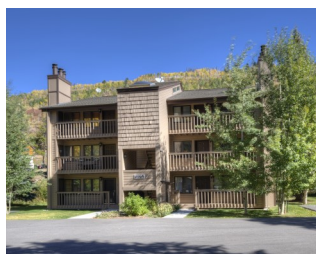
Sold by East Vail Team #10 Vail East Townhouse Condos $593,000- sold price 3 bedrooms & mountain views