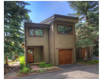
Under Contract by East Vail Team 44 Courtside $985,000- asking price 3 bedrooms & private setting