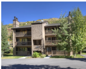
Sold by East Vail Team #10 Vail East Townhouse Condos $593,000 - sold price 3 bedrooms & mountain views