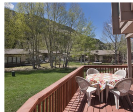
Under Contract by East Vail Team A-4 Bighorn Townhome $779,000 - asking price 3 bedrooms & mountain views