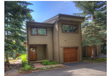
Under Contract by East Vail Team 44 Courtside $985,000 - asking price 3 bedrooms & attached garage