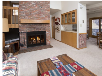
Listed by East Vail Team I-2 Racquet Club Townhome $699,000 - asking price 3 bedrooms & corner location