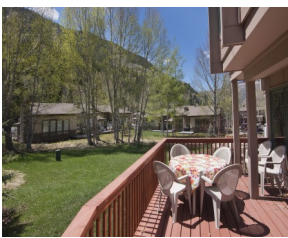
Under Contract by East Vail Team A-4 Bighorn Townhome $779,000 - asking price 3 bedrooms & mountain views