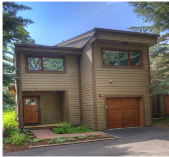
Under Contract by East Vail Team 44 Courtside $985,000 - asking price 3 bedrooms & attached garage