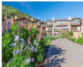
Sold by East Vail Team PU-1 Manor Vail Parking space $98,000 - sold price Covered, heated & ski locker