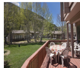
Under Contract by East Vail Team A-4 Bighorn Townhome $779,000 - asking price 3 bedrooms & mountain views