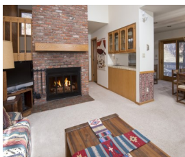
Listed by East Vail Team I-2 Racquet Club Townhome $699,000 - asking price 3 bedrooms & corner location