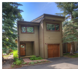
Under Contract by East Vail Team 44 Courtside $985,000 - asking price 3 bedrooms & attached garage