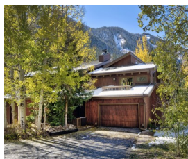
Listed by East Vail Team 4999 Main Gore Drive #A $1,385,000 - asking price 4 bedrooms & 2 car garage